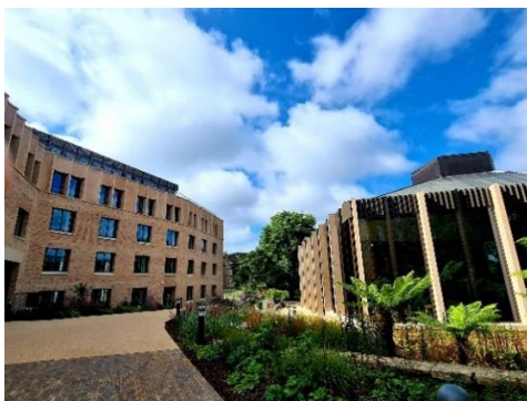
Anniversary Building and Pavilion, St Hilda's Garden Suite, St Hilda's

Founded by Dorothea Beale in 1893, St Hilda's was the last of the women's colleges to be established in Oxford. The College has remained true to its pioneering roots and continues to strive for equality as well as excellence. St Hilda's reached its 125 th anniversary in 2018, and the same year marked its 10 th anniversary as a 'mixed' college that welcomes all students. In 2021 the Anniversary Building and Pavilion were opened as part of a major redevelopment of the college's accommodation and facilities, which have enhanced significantly the experience of St Hilda's as a place to live and work.