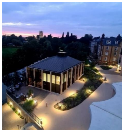
Evening view from The Rooftop Garden Suite

The Summer School will be held in The Rooftop Garden Suite, which is part of the new Anniversary Building. Surrounded by windows, the Suite is light, spacious and well-ventilated. It also offers fantastic views of the gardens and the meadows, looking towards the city skyline.